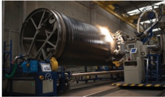
FIG. 1 Supaduct® Rural manufacturing process.